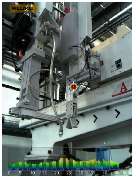
Compressed air leak detection of injection molding machines